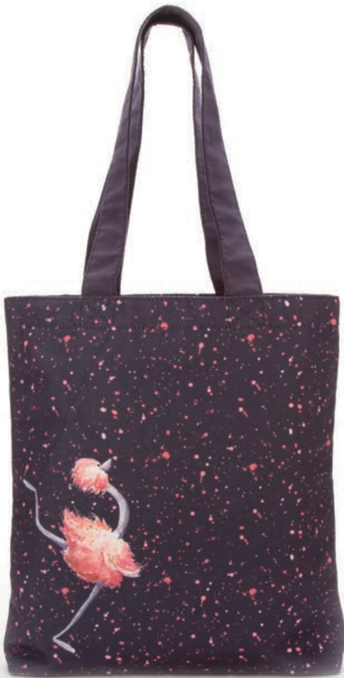
NAVY BOOK BAG GBMN3BB 40 x 36 x 1cm