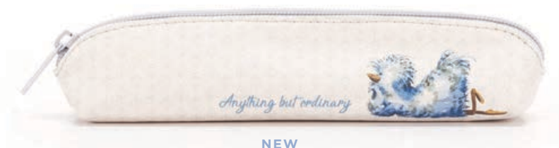
NEW LONG BAG AB4LB 5 x 21 x 4cm