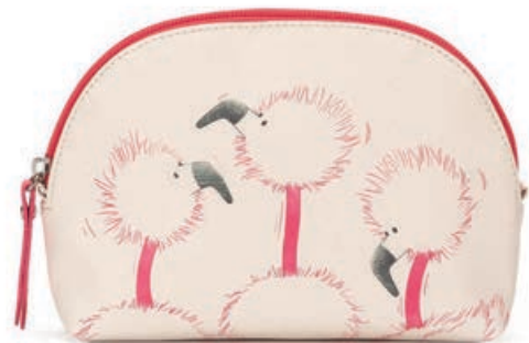
CURVED SMALL BAG FYF4CSB 13 x 19 x 6cm