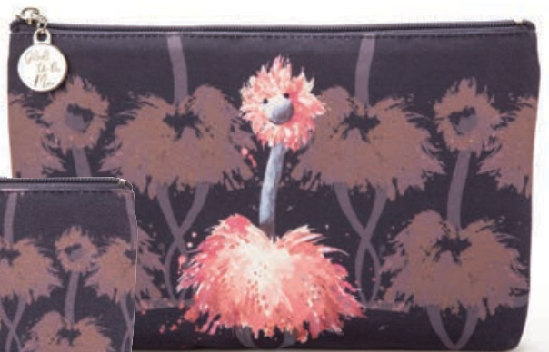
NAVY POUCH LARGE GBMN6PM 19 x 27 x 1cm