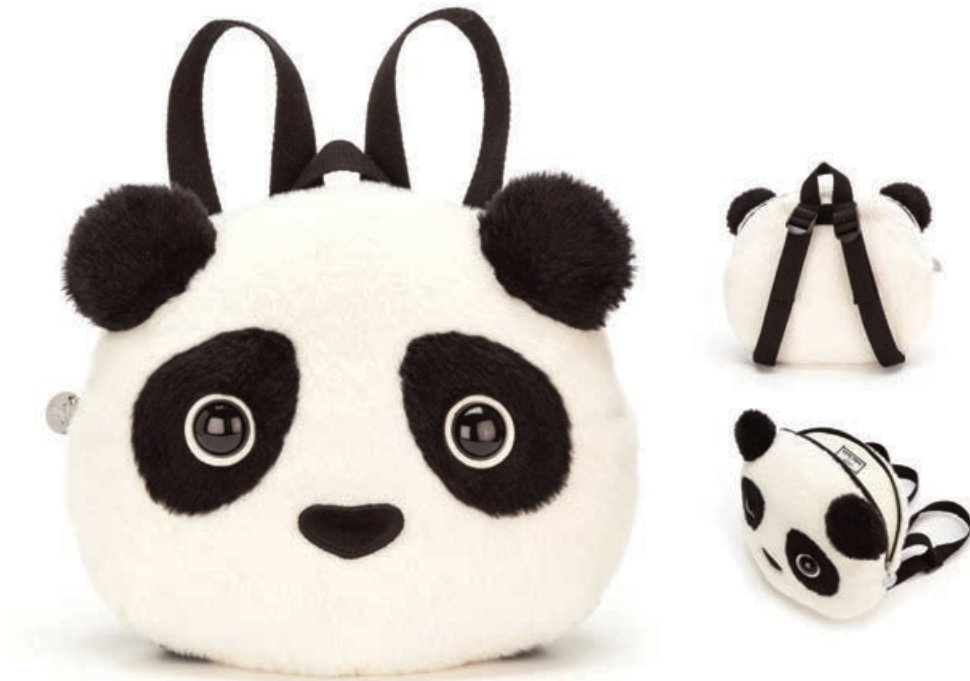
PANDA BACKPACK KUT4PBP 22 x 26 x 10cm