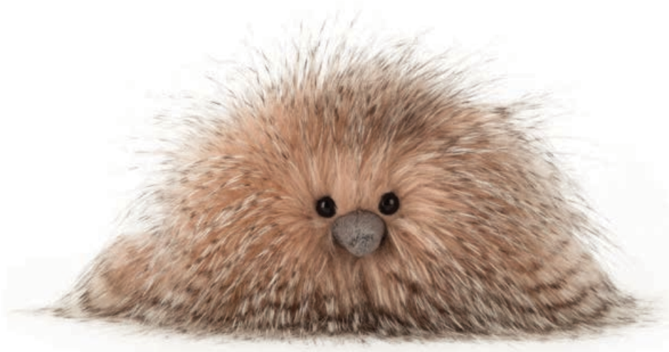
FLUFFY BAG GBM4FB 12 x 20 x 8cm