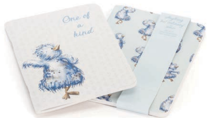
NEW NOTE BOOK SET AB4NB A6 (lined)