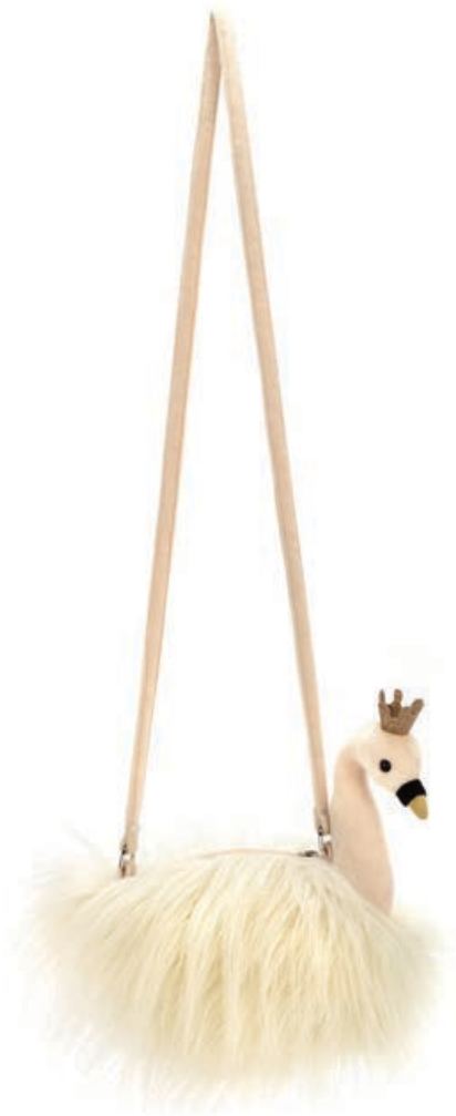
NEW FANCY SWAN BAG FA4SB 21 x 22 x 8cm (strap length 112cm)