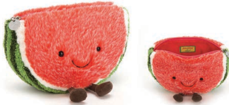
WATERMELON SMALL BAG A4WSB 16 x 23 x 7cm