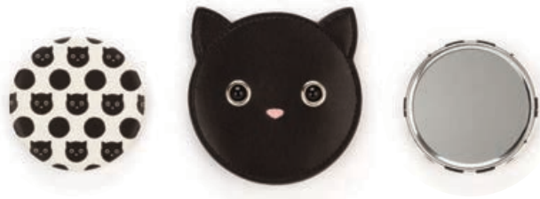
KITTY POUCH MIRROR KUT4KM 7 x 7 x 1cm