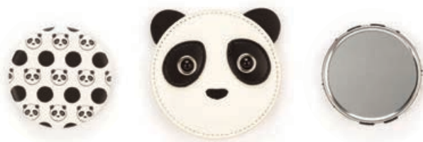
PANDA POUCH MIRROR KUT4PM 7 x 7 x 1cm