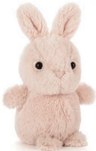
BUNNY Large KUT2B 26cm Small KUT6B 11cm