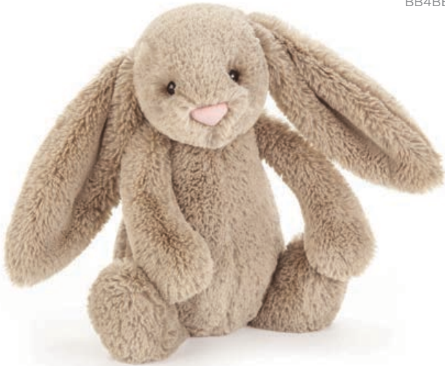
BASHFUL BEIGE BUNNY Medium BAS3B 31cm