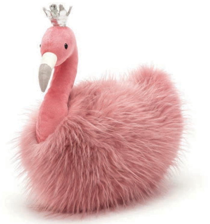
NEW FANCY FLAMINGO FLUFFY FA2F 34 x 38 x 13cm