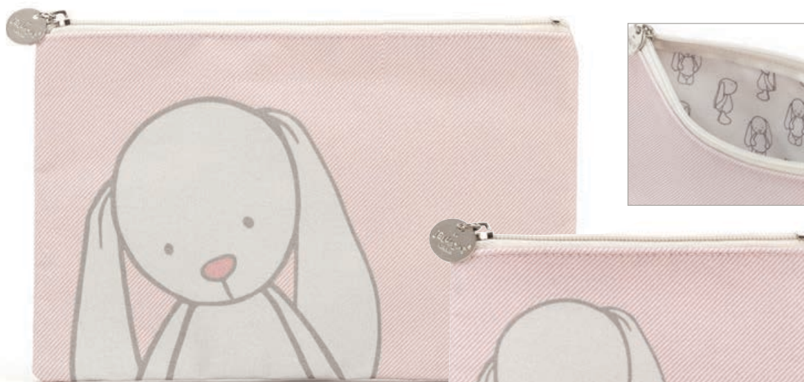
NEW BASHFUL BUNNY FLAT BAG LARGE patterned lining BB4LCFB 18 x 26 x 1cm