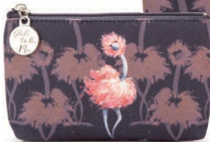
NAVY POUCH GBMN6PS 12 x 17 x 1cm