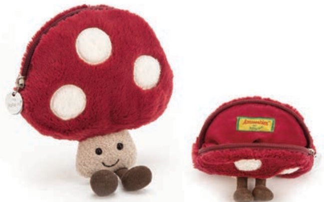
MUSHROOM POUCH A4MP 10 x 13 x 3cm