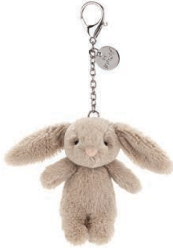
NEW BASHFUL BUNNY BEIGE BAG CHARM BB4BBC 8 x 4 x 3cm