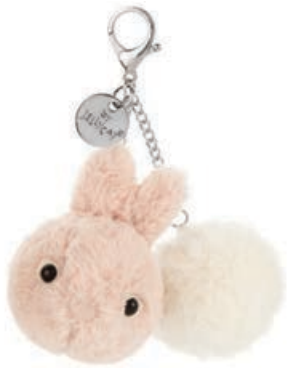
BUNNY BAG CHARM KUT4BBC 7 x 7 x 6cm