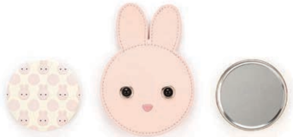
BUNNY POUCH MIRROR KUT4BM 7 x 7 x 1cm