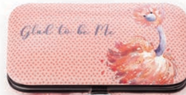
PINK NAIL CARE KIT GBM4NC 6 x 10.5 x 2cm