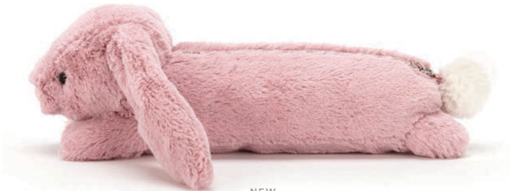
NEW BASHFUL BUNNY TULIP LONG BAG patterned lining BB4TPC 7 x 6 x 23cm