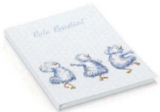
NEW RULE RESISTANT NOTE BOOK AB4RR A5 (blank)