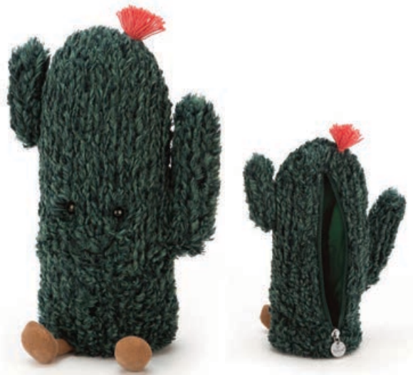
CACTUS LONG BAG A4CLB 23 x 11 x 4cm