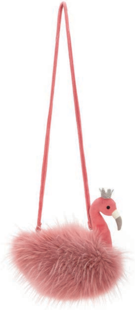
NEW FANCY FLAMINGO BAG FA4FB 21 x 22 x 8cm (strap length 112cm)