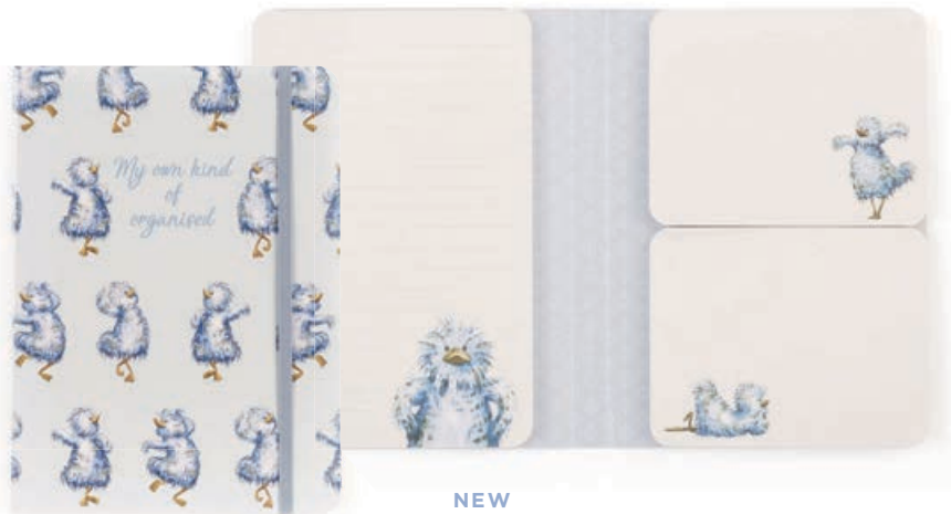
NEW STICKY NOTE SET AB4SN 17 x 12 x 1cm