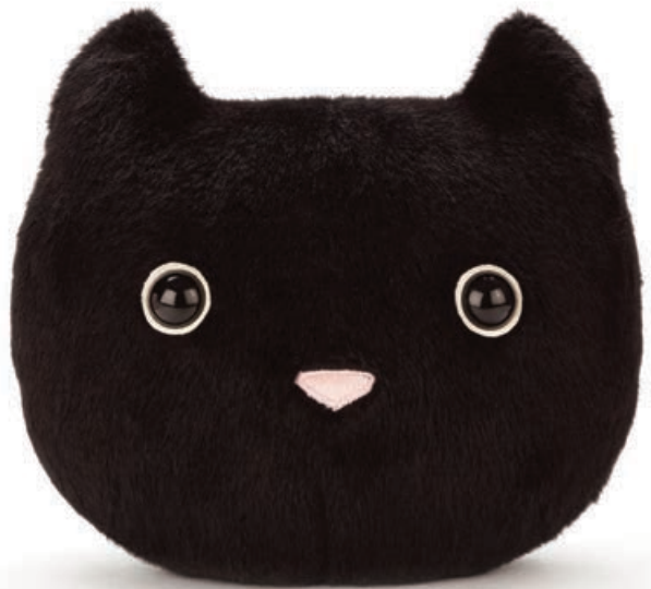
KITTY CUSHION KUT2KC 25 x 30 x 13cm (includes pad)