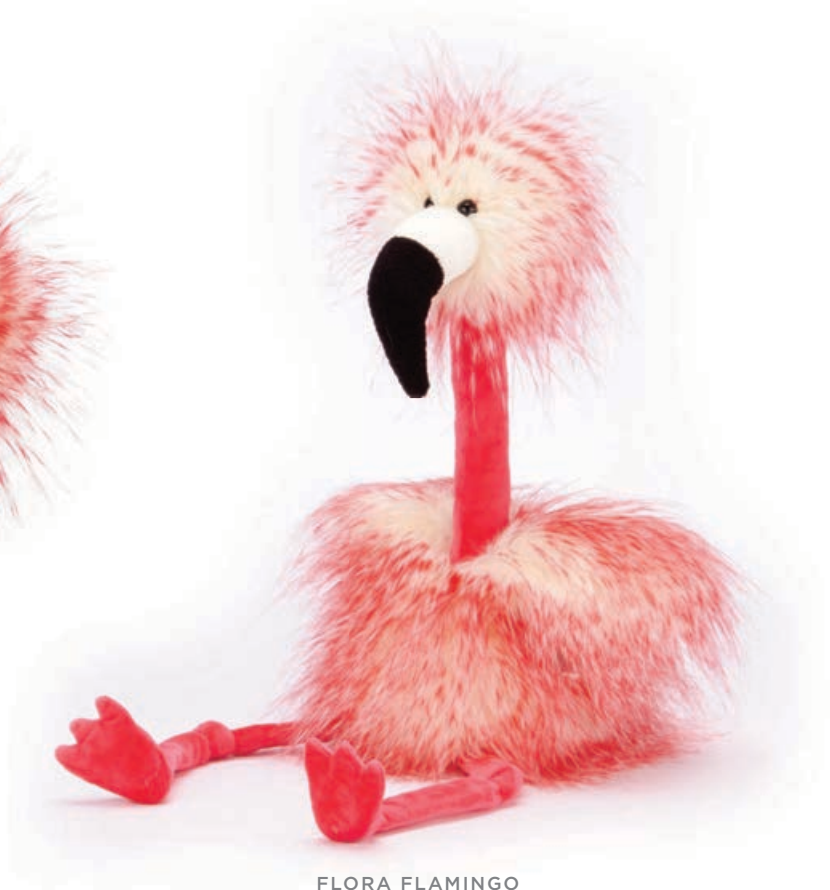
FLORA FLAMINGO Large FLA2LF 70cm Medium FLA2F 49cm