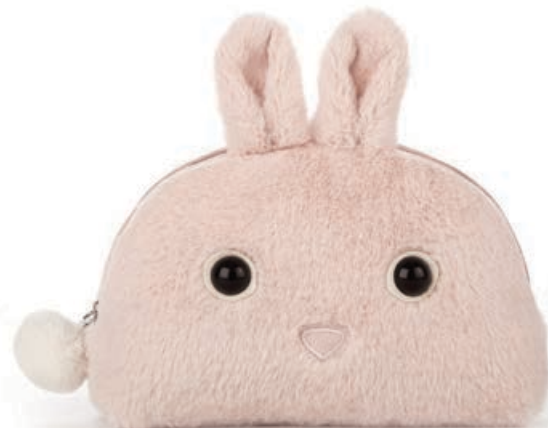
BUNNY SMALL BAG KUT4B 15 x 21 x 3cm