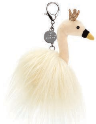
NEW FANCY SWAN BAG CHARM FA4SBC 14 x 6 x 6cm