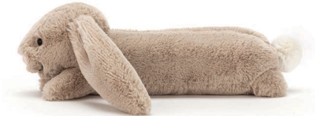
NEW BASHFUL BUNNY BEIGE LONG BAG patterned lining BB4BPC 7 x 6 x 23cm