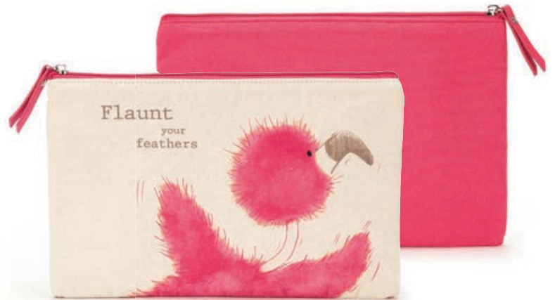
LARGE POUCH FYF4LP 18 x 27 x 1cm