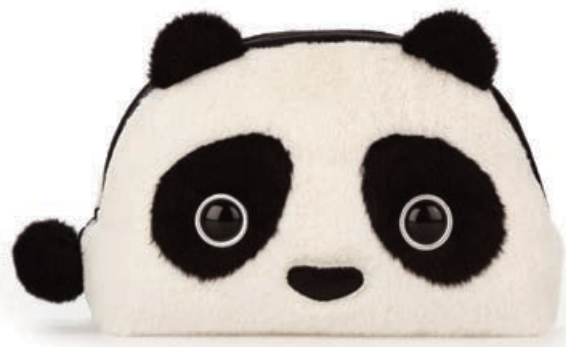
PANDA SMALL BAG KUT4PBS 15 x 21 x 3cm