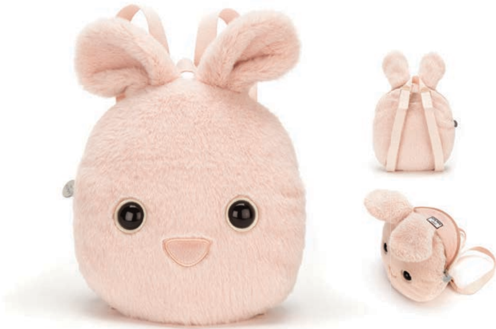
BUNNY BACKPACK KUT4BBP 22 x 26 x 10cm