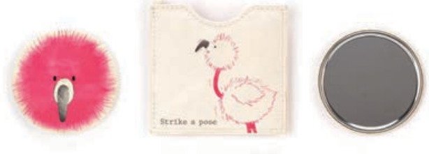
POUCH MIRROR FYF4PM 7 x 7 x 1cm