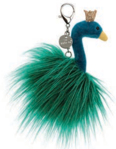
NEW FANCY PEACOCK BAG CHARM FA4PBC 14 x 6 x 6cm