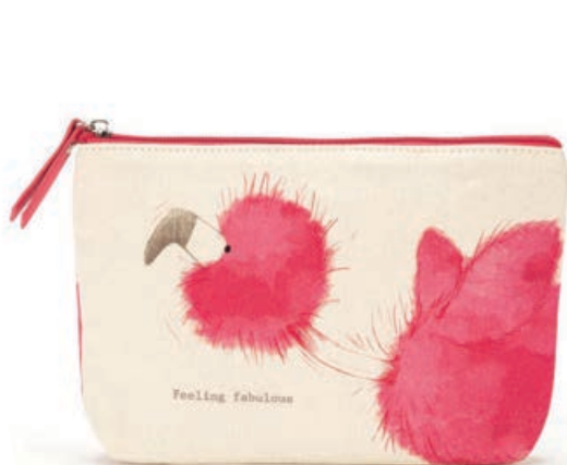
SMALL BAG FYF4SB 15 x 22 x 5cm