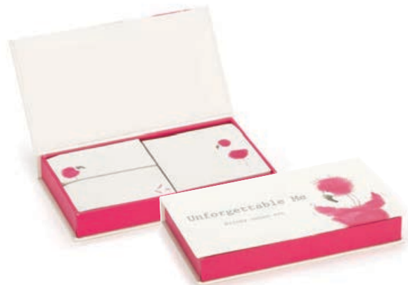
STICKY NOTES FYF4SN 9 x 17 x 3cm (packaged)