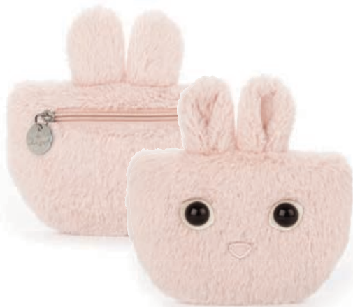
BUNNY PURSE KUT4BP 10 x 14 x 1cm