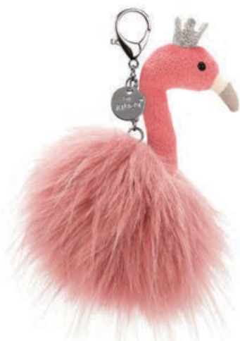
NEW FANCY FLAMINGO BAG CHARM FA4FBC 14 x 6 x 6cm