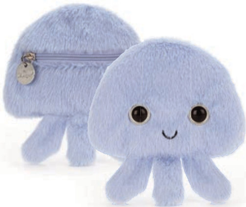
JELLYFISH PURSE KUT4JP 10 x 14 x 1cm