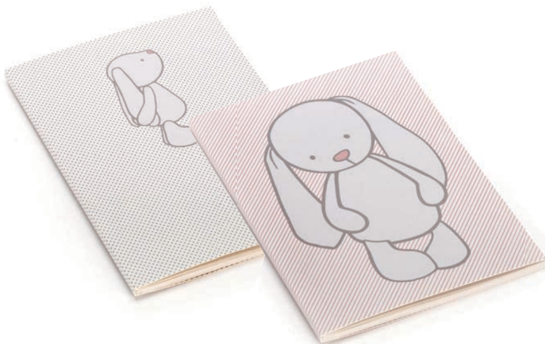
NEW BASHFUL BUNNY BEIGE SPOTS A6 NOTE BOOK BB6A6B (lined)