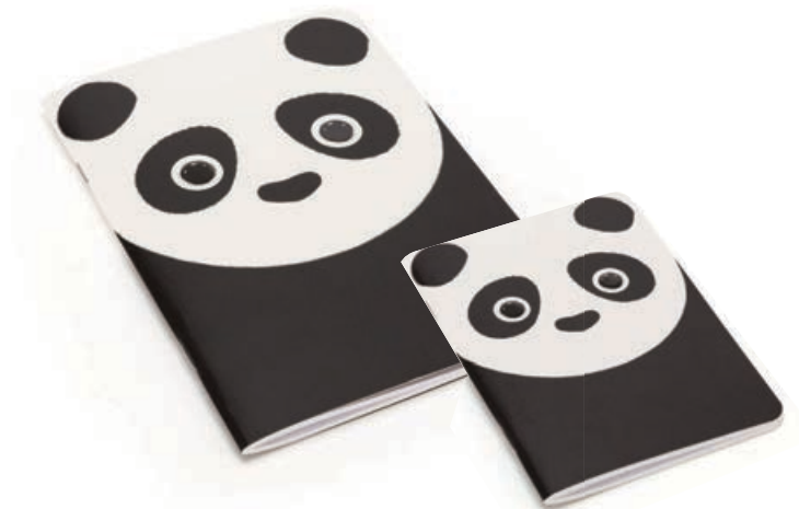
PANDA A5 NOTE BOOK KUT6PA5 (lined) PANDA A6 NOTE BOOK KUT6PA6 (lined)