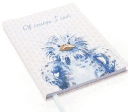
NEW OF COURSE I CAN NOTE BOOK AB4OC A5 (lined)