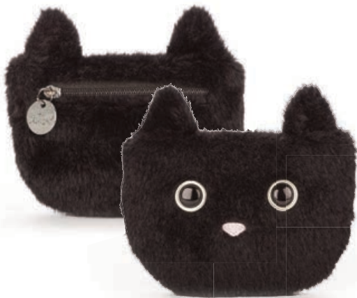
KITTY PURSE KUT4KP 10 x 14 x 1cm