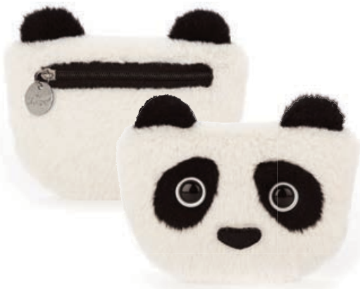
PANDA PURSE KUT4PP 10 x 14 x 1cm