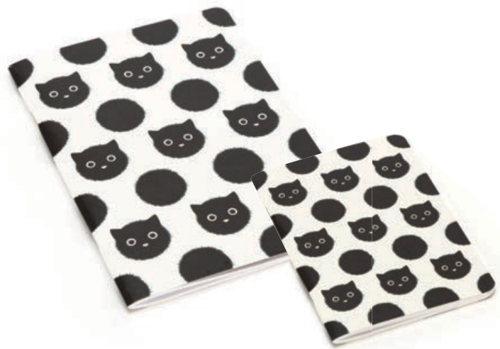
KITTY A5 NOTE BOOK KUT6KA5 (lined) KITTY A6 NOTE BOOK KUT6KA6 (lined)