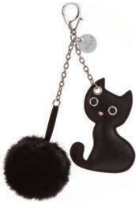
KITTY BAG CHARM KUT4KBC 7 x 7 x 6cm