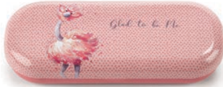
PINK GLASSES CASE GBMP6GL 7 x 16 x 3cm