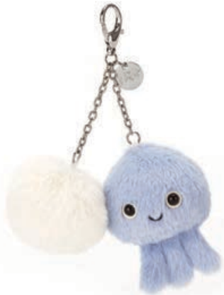
JELLYFISH BAG CHARM KUT4JBC 7 x 7 x 6cm