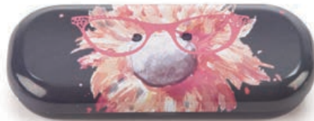
NAVY GLASSES CASE GBMN6GL 7 x 16 x 3cm