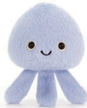
JELLYFISH KUT6J 11cm