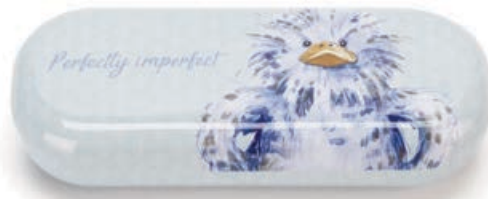
NEW GLASSES CASE AB4GC 7 x 16 x 3cm