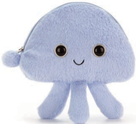
JELLYFISH SMALL BAG KUT4JSB 15 x 21 x 3cm