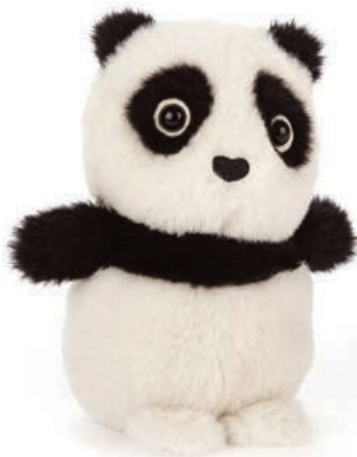
PANDA Large KUT2P 26cm Small KUT6P 11cm