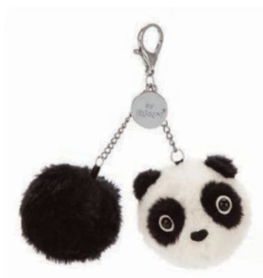
PANDA BAG CHARM KUT4PBC 7 x 7 x 6cm