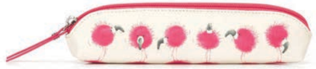
PEN POUCH FYF4PP 5 x 21 x 4cm