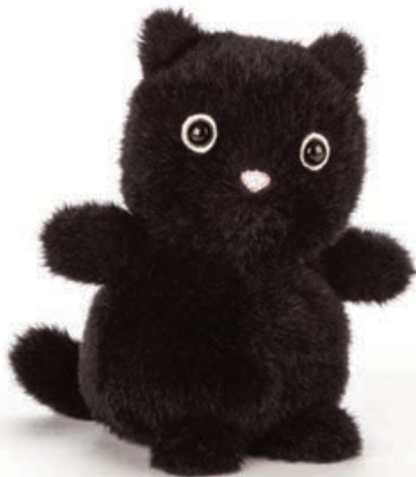
KITTY Large KUT2K 26cm Small KUT6K 11cm