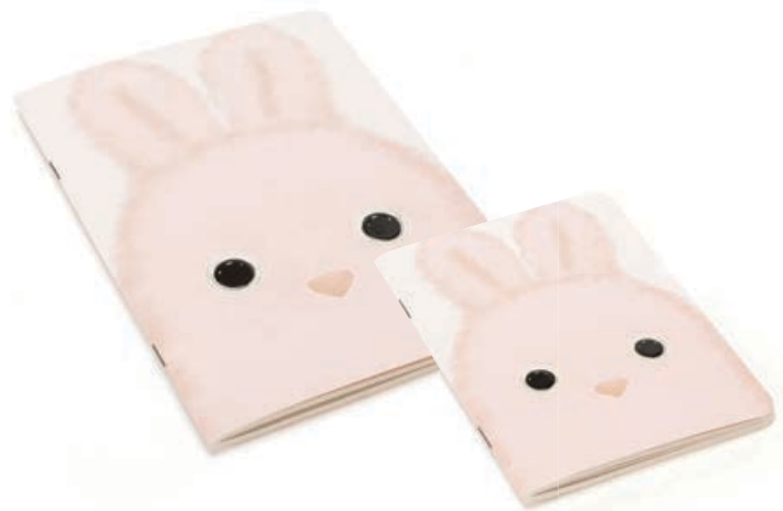
BUNNY A5 NOTE BOOK KUT6BA5 (lined) BUNNY A6 NOTE BOOK KUT6BA6 (lined)