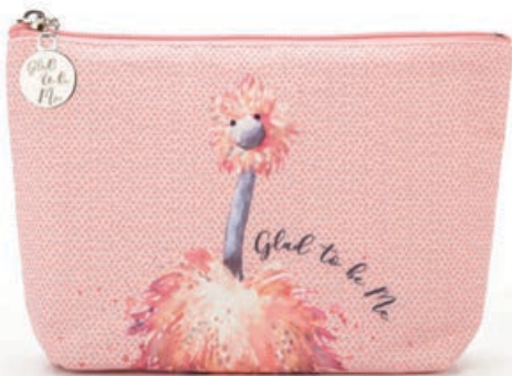
PINK BAG SMALL GBMP6BS 15 x 20 x 6cm