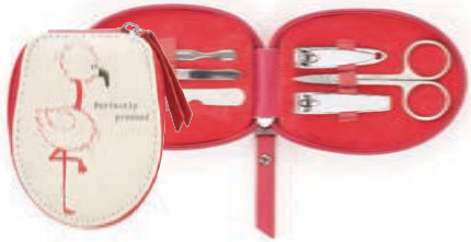
MANICURE POUCH FYF4MP 11 x 8 x 2cm