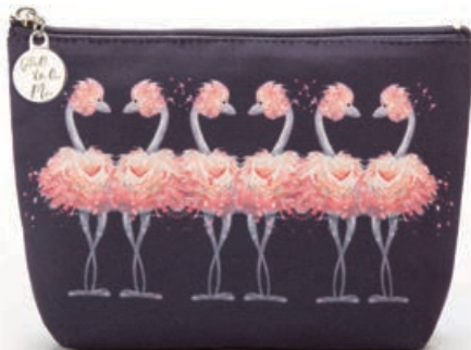
NAVY BAG SMALL GBMN6BS 15 x 20 x 6cm