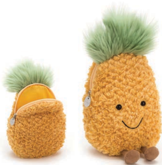
PINEAPPLE SMALL BAG A4PSB 18 x 15 x 7cm