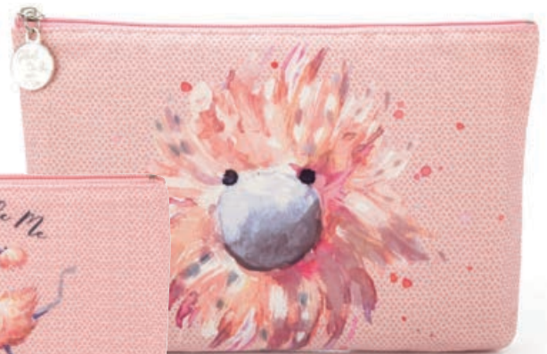
PINK POUCH LARGE GBMP6PM 19 x 27 x 1cm