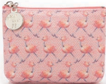
PINK COIN PURSE GBMP6CP 11 x 14 x 1cm