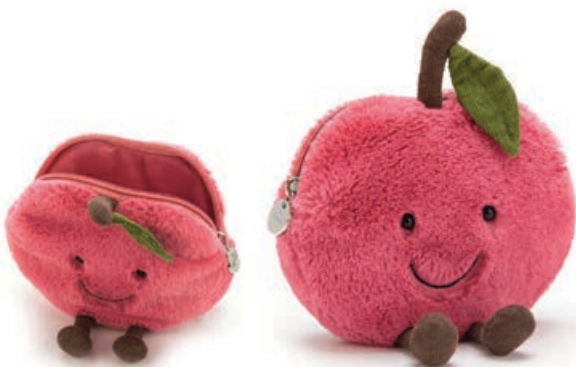
CHERRY POUCH A4CHP 12 x 14 x 3cm