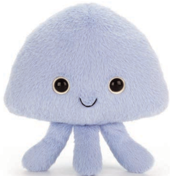
JELLYFISH CUSHION KUT2JC 21 x 30 x 13cm (includes pad)