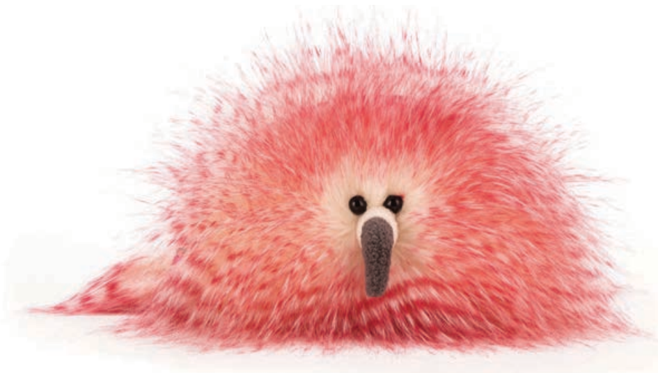
FLUFFY BAG FYF4FB 12 x 20 x 8cm