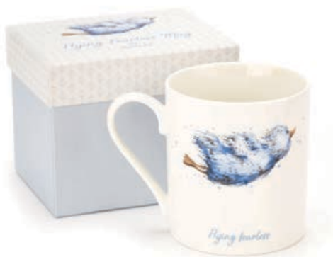
NEW MUG AB4MG 12 x 10 x 10cm (packaged)