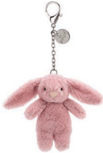
NEW BASHFUL BUNNY TULIP BAG CHARM BB4TBC 8 x 4 x 3cm