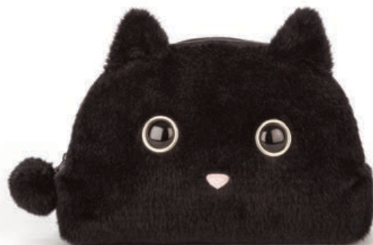
KITTY SMALL BAG KUT4K 15 x 21 x 3cm