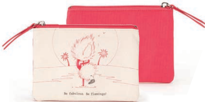
POUCH FYF4P 11 x 15 x 1cm