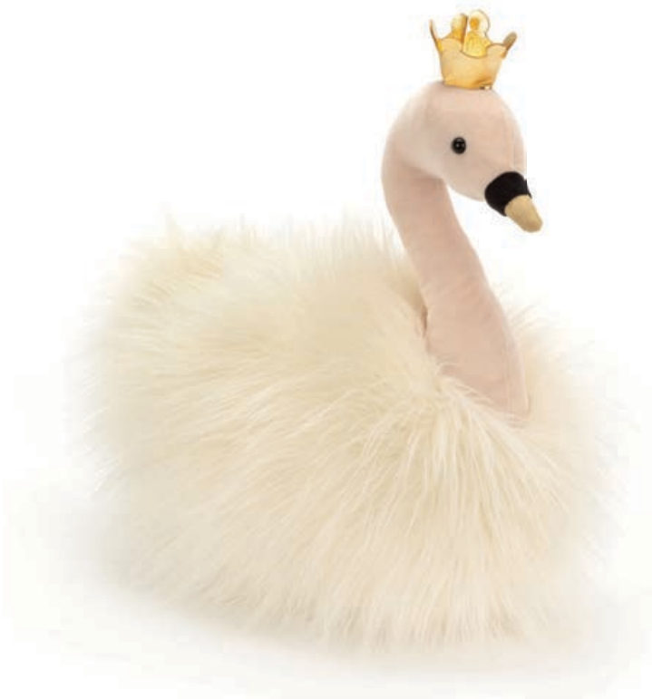
NEW FANCY SWAN FLUFFY FA2S 34 x 38 x 13cm