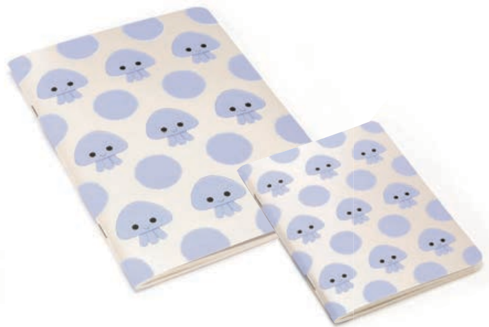
JELLYFISH A5 NOTE BOOK KUT6JA5 (lined) JELLYFISH A6 NOTE BOOK KUT6JA6 (lined)