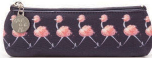
NAVY LONG BAG GBMN6LB 7 x 21 x 5cm