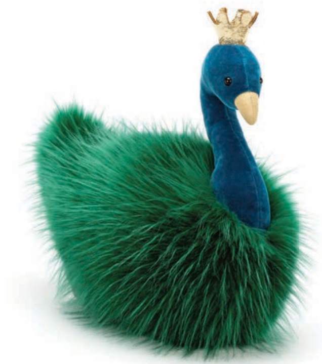
NEW FANCY PEACOCK FLUFFY FA2P 34 x 38 x 13cm