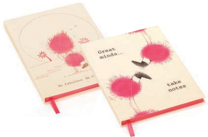
BE FABULOUS NOTE BOOK FYF4BF A5 (blank) GREAT MINDS NOTE BOOK FYF4GM A5 (lined)