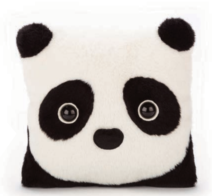
PANDA CUSHION KUT2PC 27 x 27 x 13cm (includes pad)