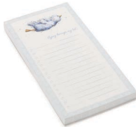
NEW TO DO LIST AB4TDL 20 x 10 x 1cm