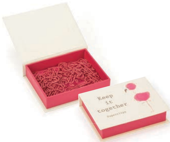
PAPER CLIPS FYF4PC 9 x 11 x 2.5cm (packaged)