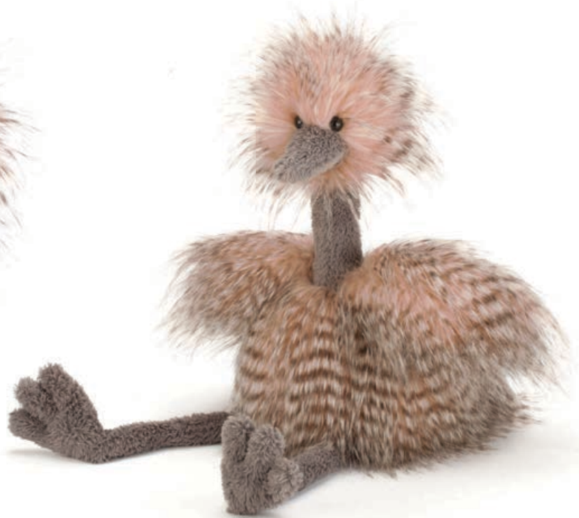
ODETTE OSTRICH Really Big ODE1RBO 92cm Big ODE2BO 70cm Medium ODE2O 49cm