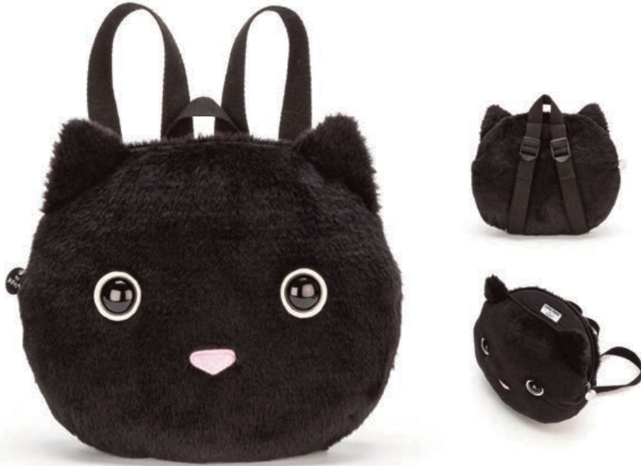
KITTY BACKPACK KUT4KBP 22 x 26 x 10cm