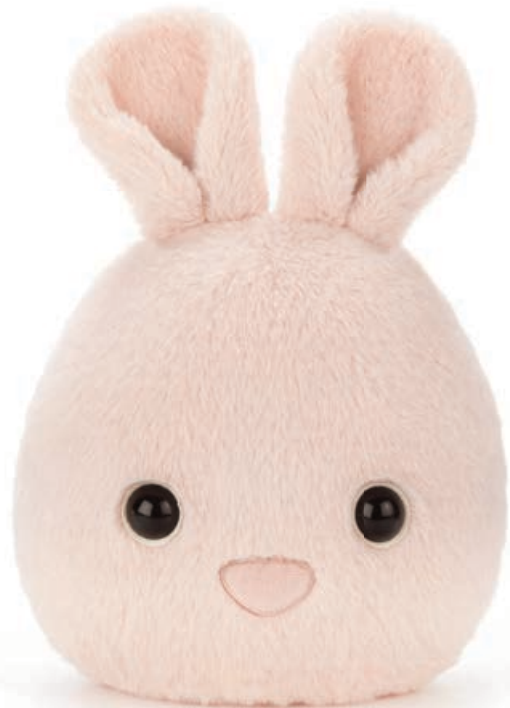
BUNNY CUSHION KUT2BC 27 x 27 x 13cm (includes pad)