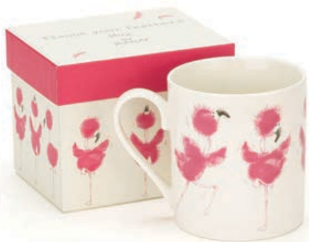
MUG FYF4MG 10 x 12 x 9.5cm (packaged)