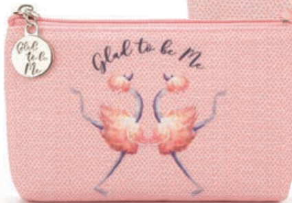
PINK POUCH GBMP6PS 12 x 17 x 1cm