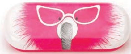
GLASSES CASE FYF6GL 7 x 16 x 3cm