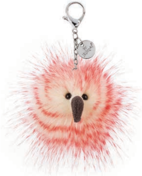
BAG CHARM FYF4BC 7 x 7 x 7cm