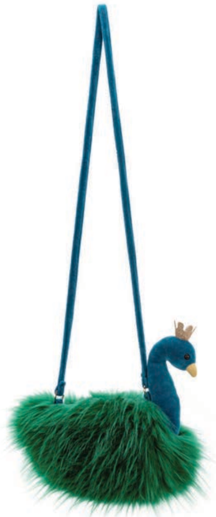
NEW FANCY PEACOCK BAG FA4PB 21 x 22 x 8cm (strap length 112cm)