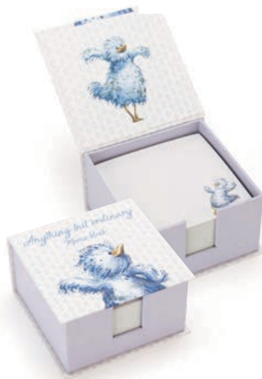
NEW MEMO BLOCK AB4MB 11 x 11 x 7cm