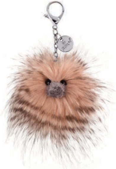
BAG CHARM GBM4BC 7 x 7 x 7cm