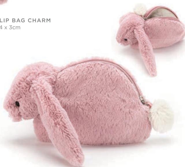
NEW BASHFUL BUNNY TULIP POUCH patterned lining BB4TP 10 x 13 x 5cm