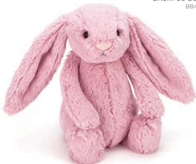
BASHFUL TULIP BUNNY Medium BAS3BTP 31cm