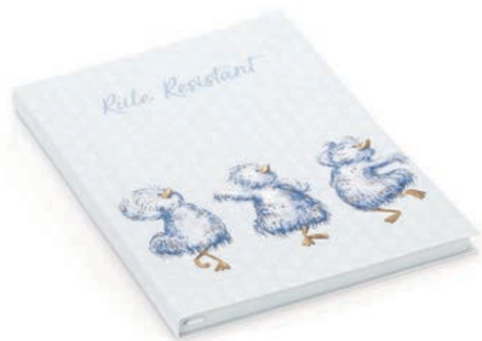
NEW RULE RESISTANT NOTE BOOK AB4RR A5 (blank)