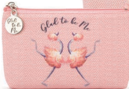
PINK POUCH GBMP6PS 12 x 17 x 1cm